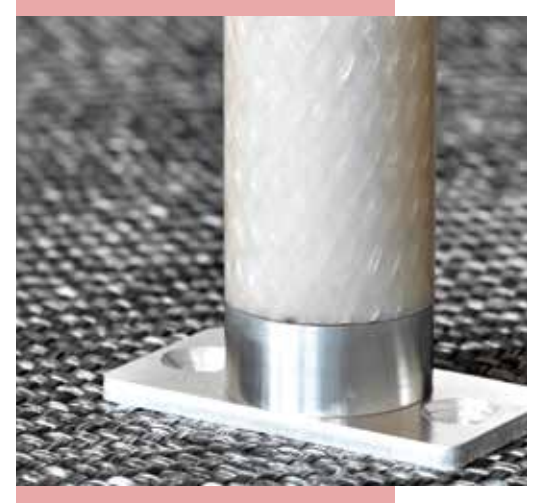
Braided fiber reinforced tubes