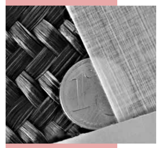
Thin walled organo sheets